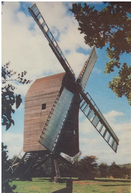
Nutley Windmill in days gone by