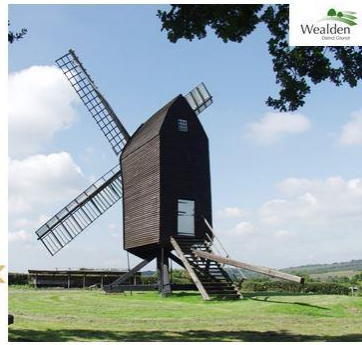
ABOVE: BRIDGE COTTAGE AND NUTLEY WINDMILL